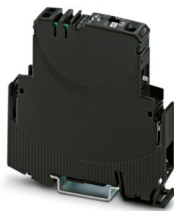
Electronic circuit breaker, 1 reset input, nominal current: 6 A

Please be informed that the data shown in this PDF document is generated from our online catalog. Please find the complete data in the user documentation. Our general terms of use for downloads are valid.