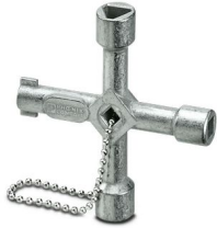
Control cabinet key, metal, for all common types of control cabinet

Please be informed that the data shown in this PDF document is generated from our online catalog. Please find the complete data in the user documentation. Our general terms of use for downloads are valid.