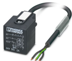
Sensor/actuator cable, 3-position, PUR halogen-free, black-gray RAL 7021, free cable end, on Valve connector A, with 1 LED, Wiring: Freewheeling diode, cable length: 1.5 m

Please be informed that the data shown in this PDF document is generated from our online catalog. Please find the complete data in the user documentation. Our general terms of use for downloads are valid.