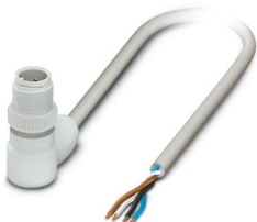
Sensor/actuator cable, 4-position, PP-EPDM, gray RAL 7035, Plug angled M12, coding: A, on free cable end, cable length: 3 m, Hygienic design, with plastic knurl

Please be informed that the data shown in this PDF document is generated from our online catalog. Please find the complete data in the user documentation. Our general terms of use for downloads are valid.