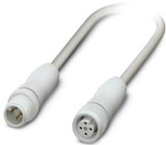
Sensor/actuator cable, 4-position, PP-EPDM, gray RAL 7035, Plug straight M12, coding: A, on Socket straight M12, cable length: 0.3 m, Hygienic design, with plastic knurl

Please be informed that the data shown in this PDF document is generated from our online catalog. Please find the complete data in the user documentation. Our general terms of use for downloads are valid.