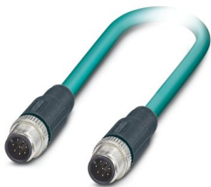
Assembled Ethernet cable, shielded, 4-pair, 26 AWG stranded (7-wire), RAL 5021 (water blue), M12 plug to M12 plug, line, length: 15 m

Please be informed that the data shown in this PDF document is generated from our online catalog. Please find the complete data in the user documentation. Our general terms of use for downloads are valid.