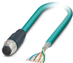
Assembled Ethernet cable, shielded, 4-pair, 26 AWG stranded (7-wire), RAL 5021 (water blue), M12 male plug to free cable end, line, length: 4 m

Please be informed that the data shown in this PDF document is generated from our online catalog. Please find the complete data in the user documentation. Our general terms of use for downloads are valid.