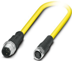
Sensor/actuator cable, 3-position, PVC, yellow, Plug straight M12, coding: A, on Socket straight M8, coding: A, cable length: 1.5 m

Please be informed that the data shown in this PDF document is generated from our online catalog. Please find the complete data in the user documentation. Our general terms of use for downloads are valid.