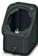
HEAVYCON EVO sleeve housing, plastic, with bayonet flange for EVO screw connection, B6, for single locking latch, height: 60.5 mm, without EVO screw connection

Please be informed that the data shown in this PDF document is generated from our online catalog. Please find the complete data in the user documentation. Our general terms of use for downloads are valid.