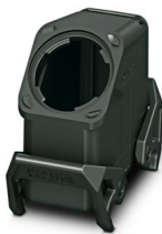
HEAVYCON EVO sleeve housing, plastic, with bayonet flange for EVO screw connection, B16, with double locking latch, height: 78 mm, without EVO screw connection

Please be informed that the data shown in this PDF document is generated from our online catalog. Please find the complete data in the user documentation. Our general terms of use for downloads are valid.