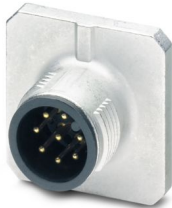
Device connector front mounting, Universal, 8-position, Pin, straight, M12, coding: A, Front mounting, Square flange, Wave soldering, 0.25 mm 2

Please be informed that the data shown in this PDF document is generated from our online catalog. Please find the complete data in the user documentation. Our general terms of use for downloads are valid.