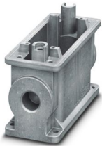
HEAVYCON ADVANCE B16 basic housing without screw openings, for M6 screw locking, salt-water-resistant aluminum, without surface coating

Please be informed that the data shown in this PDF document is generated from our online catalog. Please find the complete data in the user documentation. Our general terms of use for downloads are valid.