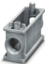
HEAVYCON ADVANCE B24 box mounting base, for M6 screw locking, salt-water-resistant aluminum, with 2 x M25 thread, without surface coating

Please be informed that the data shown in this PDF document is generated from our online catalog. Please find the complete data in the user documentation. Our general terms of use for downloads are valid.