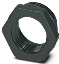
Reducing adapter, connecting thread: M40 x 1.5, color: jet black, with flat gasket

Please be informed that the data shown in this PDF document is generated from our online catalog. Please find the complete data in the user documentation. Our general terms of use for downloads are valid.