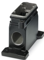
HEAVYCON B6 box mounting base, for screw locking, HPR series, with 2 x M25 gland, for increased environmental and EMC requirements

Please be informed that the data shown in this PDF document is generated from our online catalog. Please find the complete data in the user documentation. Our general terms of use for downloads are valid.