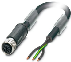
Power cable, 3-position, PVC, black, free cable end, on Socket straight M12, coding: S, cable length: 10 m, For alternating current up to 16 A/690 V

Please be informed that the data shown in this PDF document is generated from our online catalog. Please find the complete data in the user documentation. Our general terms of use for downloads are valid.