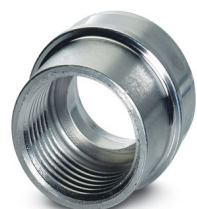
Housing screw connection, Socket, M12, Front mounting, Alternative product in accordance with RoHS II without Exemption 6c (Pb < 0.1 %) item no.: 1238973

https://www.phoenixcontact.com/us/products/1412081