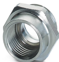
M12 female connector, front mounting SMD with M14 screw fastening

https://www.phoenixcontact.com/us/products/1412079