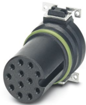
Contact carrier, 12-position, Socket, straight, M12, coding: A, PCB mounting, SMD reflow, Alternative product in accordance with RoHS II without Exemption 6c (Pb < 0.1 %) item no.: 1238927

Please be informed that the data shown in this PDF document is generated from our online catalog. Please find the complete data in the user documentation. Our general terms of use for downloads are valid.