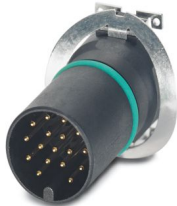
Contact carrier, 17-position, Pin, straight, M12, coding: A, PCB mounting, SMD reflow, Alternative product in accordance with RoHS II without Exemption 6c (Pb < 0.1 %) item no.: 1238935

Please be informed that the data shown in this PDF document is generated from our online catalog. Please find the complete data in the user documentation. Our general terms of use for downloads are valid.