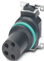
Contact carrier, 4-position, Socket, straight, M8, coding: A, PCB mounting, SMD reflow, Alternative product in accordance with RoHS II without Exemption 6c (Pb < 0.1 %) item no.: 1308257

Please be informed that the data shown in this PDF document is generated from our online catalog. Please find the complete data in the user documentation. Our general terms of use for downloads are valid.