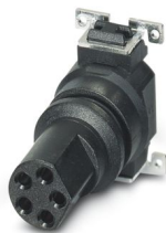
Contact carrier, Universal, 5-position, Socket, straight, M8, coding: B, PCB mounting, SMD reflow, Alternative product in accordance with RoHS II without Exemption 6c (Pb < 0.1 %) item no.: 1238985

Please be informed that the data shown in this PDF document is generated from our online catalog. Please find the complete data in the user documentation. Our general terms of use for downloads are valid.