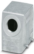
Sleeve housing B10, for double locking latch, material: Die-cast aluminum, salt water resistant, cable outlets: 1, lateral, 1x Pg29, height: 72 mm, cable gland: none, Standard

Please be informed that the data shown in this PDF document is generated from our online catalog. Please find the complete data in the user documentation. Our general terms of use for downloads are valid.