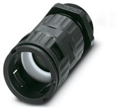
Cable gland, Pg thread, IP68/69k protection, with strain relief

https://www.phoenixcontact.com/us/products/3240935