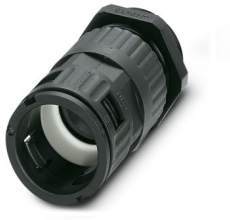
Cable gland, Pg thread, IP66 protection, with strain relief

https://www.phoenixcontact.com/us/products/3240949