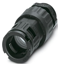
Cable gland, metric thread, IP68/69k protection, with strain relief

https://www.phoenixcontact.com/us/products/3240941