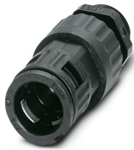
Cable gland, metric thread, IP66 protection, with strain relief

https://www.phoenixcontact.com/us/products/3240955