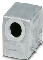
Sleeve housing B10, for double locking latch, material: Die-cast aluminum, salt water resistant, cable outlets: 1, lateral, 1x M25, height: 57 mm, cable gland: none, Standard

Please be informed that the data shown in this PDF document is generated from our online catalog. Please find the complete data in the user documentation. Our general terms of use for downloads are valid.