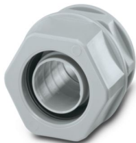
Cable gland made from PP with Pg thread, IP65 protection

https://www.phoenixcontact.com/us/products/3240992