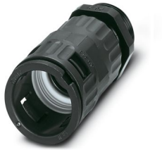
Cable gland, Pg thread, IP68/69k protection, with strain relief

https://www.phoenixcontact.com/us/products/3240934