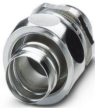
Cable gland made from brass with metric thread, IP40 protection

https://www.phoenixcontact.com/us/products/3241047