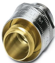
Cable gland made from brass with metric thread, rotatable, IP40 protection

https://www.phoenixcontact.com/us/products/3241033