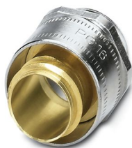
Cable gland made from brass with Pg thread, rotatable, IP40 protection

https://www.phoenixcontact.com/us/products/3241026