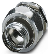
Cable gland made from brass with Pg thread, IP40 protection

https://www.phoenixcontact.com/us/products/3241040