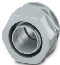
Cable gland made from PP with metric thread, IP65 protection

https://www.phoenixcontact.com/us/products/3241000