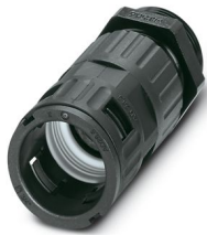
Cable gland, metric thread, IP68/69k protection, with strain relief

https://www.phoenixcontact.com/us/products/3240942