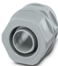
Cable gland made from PP with Pg thread, IP65 protection

https://www.phoenixcontact.com/us/products/3240991