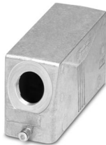
Sleeve housing B24, for single locking latch, material: Die-cast aluminum, salt water resistant, cable outlets: 1, lateral, 1x Pg16, height: 60 mm, cable gland: none, Standard

Please be informed that the data shown in this PDF document is generated from our online catalog. Please find the complete data in the user documentation. Our general terms of use for downloads are valid.