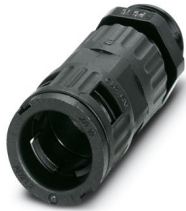
Cable gland, Pg thread, IP66 protection, with strain relief

https://www.phoenixcontact.com/us/products/3240947