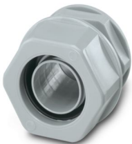
Cable gland made from PP with metric thread, IP65 protection

https://www.phoenixcontact.com/us/products/3240999