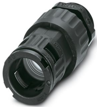
Cable gland, metric thread, IP68/69k protection, with strain relief

https://www.phoenixcontact.com/us/products/3240941