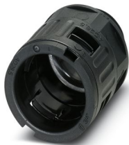
Cable gland, metric thread, IP66 protection, straight

https://www.phoenixcontact.com/us/products/3240899