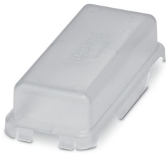
Protective cover, design: B16

https://www.phoenixcontact.com/us/products/1421102