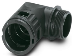
Cable gland, Pg thread, IP66 protection, angled

https://www.phoenixcontact.com/us/products/3240920