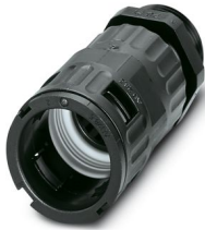
Cable gland, Pg thread, IP66 protection, with strain relief

https://www.phoenixcontact.com/us/products/3240948