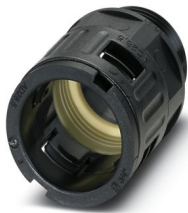
Cable gland, Pg thread, IP68/69k protection, straight

https://www.phoenixcontact.com/us/products/3240878