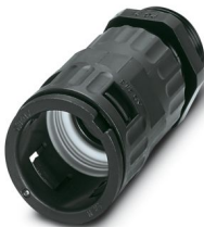
Cable gland, Pg thread, IP68/69k protection, with strain relief

https://www.phoenixcontact.com/us/products/3240934