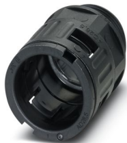
Cable gland, Pg thread, IP66 protection, straight

https://www.phoenixcontact.com/us/products/3240892