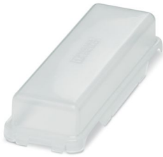
Protective cover, design: B24

https://www.phoenixcontact.com/us/products/1421103