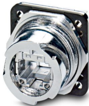
RJ45 mounting frame, IP67, for bayonet interlocking, metal, with contact insert for cable connection, for round mounting cutout, with seal, without mounting screws

Please be informed that the data shown in this PDF document is generated from our online catalog. Please find the complete data in the user documentation. Our general terms of use for downloads are valid.