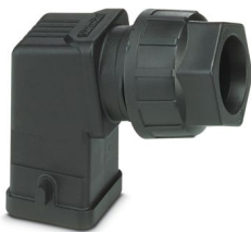
Sleeve housing D7, for single locking latch, material: PA, cable outlets: 1, lateral, M20, height: 54.5 mm, cable gland: with, Standard

Please be informed that the data shown in this PDF document is generated from our online catalog. Please find the complete data in the user documentation. Our general terms of use for downloads are valid.