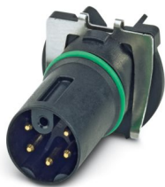
Contact carrier, Power, 6-position, Pin, straight, M12, coding: M, PCB mounting, THR solder connection

Please be informed that the data shown in this PDF document is generated from our online catalog. Please find the complete data in the user documentation. Our general terms of use for downloads are valid.