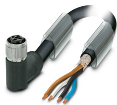
Power cable, 4-position, PUR halogen-free, black RAL 9005, shielded (Tinned copper-braided shield, approx. 85% covering), Advanced Shielding Technology, free cable end, on Socket angled M12, coding: T, cable length: 1.5 m, For direct current up to 12 A/63 V

Please be informed that the data shown in this PDF document is generated from our online catalog. Please find the complete data in the user documentation. Our general terms of use for downloads are valid.