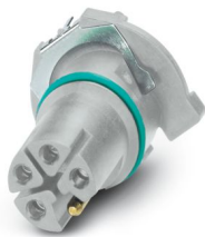
Contact carrier, Power, 5-position, Socket, straight, M12, coding: L, PCB mounting, THR solder connection

Please be informed that the data shown in this PDF document is generated from our online catalog. Please find the complete data in the user documentation. Our general terms of use for downloads are valid.