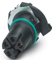
Contact carrier, Power, 4-position, Socket, straight, M12, coding: L, PCB mounting, THR solder connection

Please be informed that the data shown in this PDF document is generated from our online catalog. Please find the complete data in the user documentation. Our general terms of use for downloads are valid.