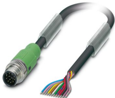
Sensor/actuator cable, 12-position, PUR halogen-free, black RAL 9005, Plug straight M12 SPEEDCON, coding: A, on free cable end, cable length: 1.5 m

Please be informed that the data shown in this PDF document is generated from our online catalog. Please find the complete data in the user documentation. Our general terms of use for downloads are valid.