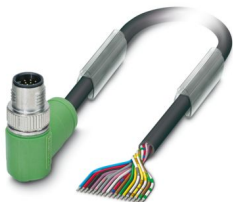
Sensor/actuator cable, 17-position, PUR halogen-free, black RAL 9005, Plug angled M12 SPEEDCON, coding: A, on free cable end, cable length: 5 m

Please be informed that the data shown in this PDF document is generated from our online catalog. Please find the complete data in the user documentation. Our general terms of use for downloads are valid.