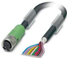
Sensor/actuator cable, 12-position, PUR/PVC, black RAL 9005, shielded (Tinned copper braided shield), free cable end, on Socket straight M12 SPEEDCON, coding: A, cable length: 1 m

Please be informed that the data shown in this PDF document is generated from our online catalog. Please find the complete data in the user documentation. Our general terms of use for downloads are valid.