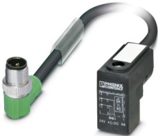
Sensor/actuator cable, 3-position, PUR halogen-free, black-gray RAL 7021, Plug angled M12 SPEEDCON, coding: A, with 1 LED, on Valve connector CI (9.4 mm), with 1 LED, Wiring: Z diode, cable length: 0.6 m

Please be informed that the data shown in this PDF document is generated from our online catalog. Please find the complete data in the user documentation. Our general terms of use for downloads are valid.