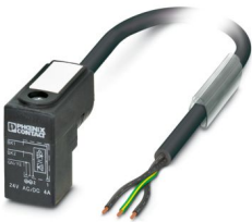
Sensor/actuator cable, 3-position, PUR halogen-free, black-gray RAL 7021, free cable end, on Valve connector CI (9.4 mm), with 1 LED, Wiring: Z diode, cable length: 1.5 m

Please be informed that the data shown in this PDF document is generated from our online catalog. Please find the complete data in the user documentation. Our general terms of use for downloads are valid.