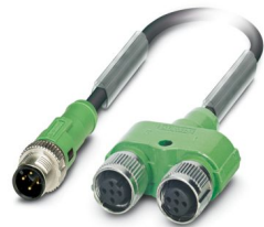
Sensor/actuator cable, 4-position, PUR halogen-free, black-gray RAL 7021, Plug straight M12 SPEEDCON, coding: A, on Socket straight M12 SPEEDCON, coding: A and Socket straight M12 SPEEDCON, coding: A, cable length: 3 m

Please be informed that the data shown in this PDF document is generated from our online catalog. Please find the complete data in the user documentation. Our general terms of use for downloads are valid.