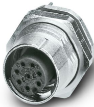
Device connector rear mounting, 8-position, Socket, M12, coding: A, Rear mounting, M16 x 1.5, Wave soldering, Alternative product in accordance with RoHS II without Exemption 6c (Pb < 0.1 %) item no.: 1239752

Please be informed that the data shown in this PDF document is generated from our online catalog. Please find the complete data in the user documentation. Our general terms of use for downloads are valid.