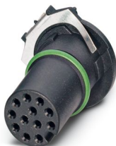
Contact carrier, 12-position, Socket, straight, M12, coding: A, PCB mounting, THR solder connection, Alternative product in accordance with RoHS II without Exemption 6c (Pb < 0.1 %) item no.: 1239761

Please be informed that the data shown in this PDF document is generated from our online catalog. Please find the complete data in the user documentation. Our general terms of use for downloads are valid.