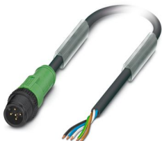
Sensor/actuator cable, 5-position, PUR halogen-free, black-gray RAL 7021, Plug straight M12, coding: A, on free cable end, cable length: 1.5 m, with plastic knurl

Please be informed that the data shown in this PDF document is generated from our online catalog. Please find the complete data in the user documentation. Our general terms of use for downloads are valid.