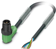
Sensor/actuator cable, 5-position, PUR halogen-free, black-gray RAL 7021, Plug angled M12, coding: A, on free cable end, cable length: 1.5 m, with plastic knurl

Please be informed that the data shown in this PDF document is generated from our online catalog. Please find the complete data in the user documentation. Our general terms of use for downloads are valid.