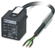
Sensor/actuator cable, 3-position, PUR halogen-free, black-gray RAL 7021, free cable end, on Valve connector A, with 1 LED, Wiring: Varistor, cable length: 3 m

Please be informed that the data shown in this PDF document is generated from our online catalog. Please find the complete data in the user documentation. Our general terms of use for downloads are valid.