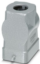
HEAVYCON B6 sleeve housing, for single locking latch, height: 72 mm, with 1 x M32 thread, straight cable outlet

Please be informed that the data shown in this PDF document is generated from our online catalog. Please find the complete data in the user documentation. Our general terms of use for downloads are valid.