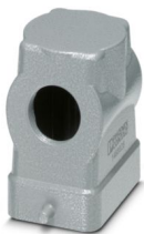
HEAVYCON B6 sleeve housing, for single locking latch, height: 72 mm, with 1 x M32 thread, lateral cable outlet

Please be informed that the data shown in this PDF document is generated from our online catalog. Please find the complete data in the user documentation. Our general terms of use for downloads are valid.